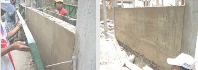
Figure 4. Frame works can be dismantled after one day.