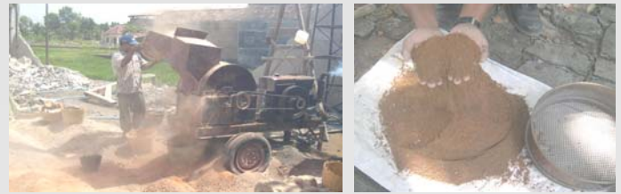
Figure 2. Mechanically crushing brick rubble using a mobile stone crusher to create fine aggregate.

The process of crushing the brick masonry wall rubble can be performed manually or mechanically. This is done to change the brick masonry wall rubble into fine aggregate that can be used for making mortar or concrete. Manual crushing requires the use of a 0.3 to 1.0 kg hammer. Mechanical crushing can be carried out using a mobile stone crusher made by the local people of Bantul, as shown in Figure 2. After crushing, the rubble is filtered to create a fine aggregate with a maximum diameter of 5 mm. The site investigation revealed that each machine can crush enough brick masonry wall rubble to create about 15 m 3 of fine aggregate per day. This requires one stone crusher operator and six other workers. To make 5 m 3 of fine aggregate, the stone crusher needs three liters of diesel oil, yielding diesel oil consumption of 0.6 liter/m 3 . No quantitative data about how much brick masonry wall rubble has been ground into