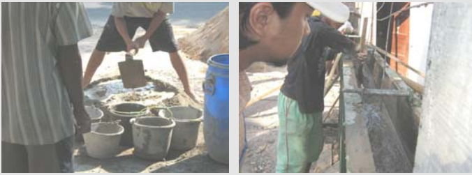
Figure 3. The mortar is mixed properly, poured into the prepared frame work, and compacted with a stick.