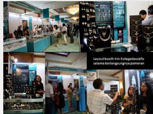
Craftsmen participate in national and international exhibitions.

Based on these achievements, there are several challenges to be addressed. Efforts must be made to improve the uniqueness and quality of design in order to compete with other products, and to strengthen product promotional efforts in Kotagede and beyond by providing and preparing locations for collective showrooms.