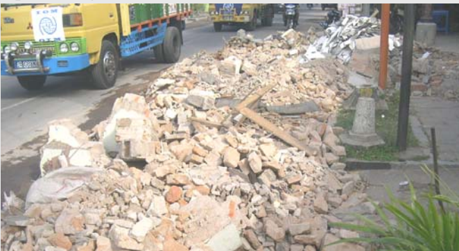
Figure 1. Masonry brick wall rubble by the side of a road. rubble was huge, this effort was very costly.

Most communities and governments assume that brick masonry wall rubble is debris that must be disposed of. As can be seen in Figure 1, most of the rubble was thrown to the side of the roads. This impeded traffic and caused traffic jams. To avoid this problem, the government carried out a program to clean away the rubble (Yogyakarta Special Region and Central Java, 2007). As the amount of