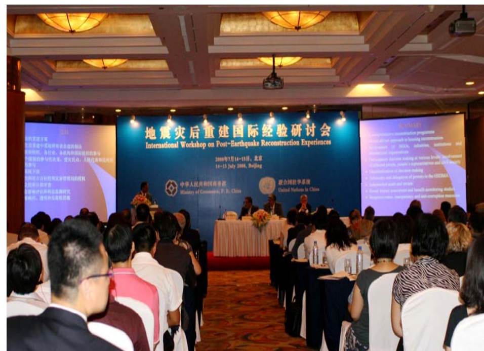
Post-Earthquake Reconstruction Experiences Workshop, Beijing, 14 July 2008