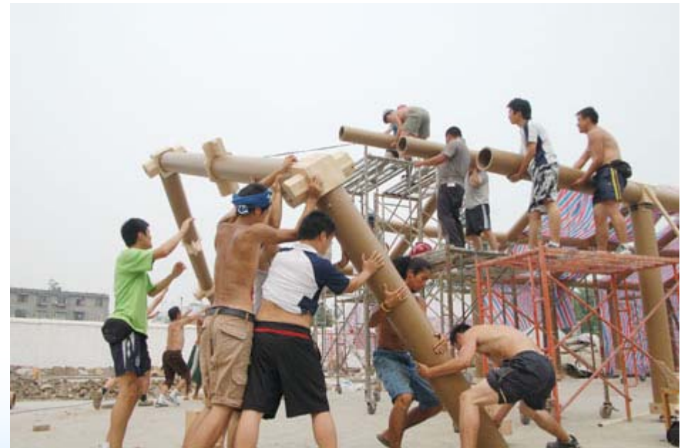
Students set up Shigeru Ban Research centre temporary paper tube housing structures

Bolder steps in reconstruction to transform Wenchuan earthquake-affected areas into a model of green low-carbon economy