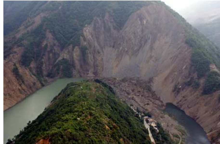
Aerial view of Tangjiashan quake lake near Beichuan County. May 26, 2008