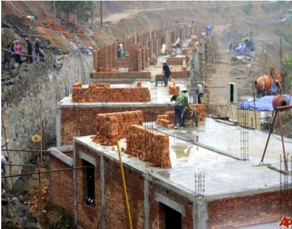
Workers build houses at a resettlement place in Hanzhong northwest China's Shaanxi Province, Oct. 17, 2008.