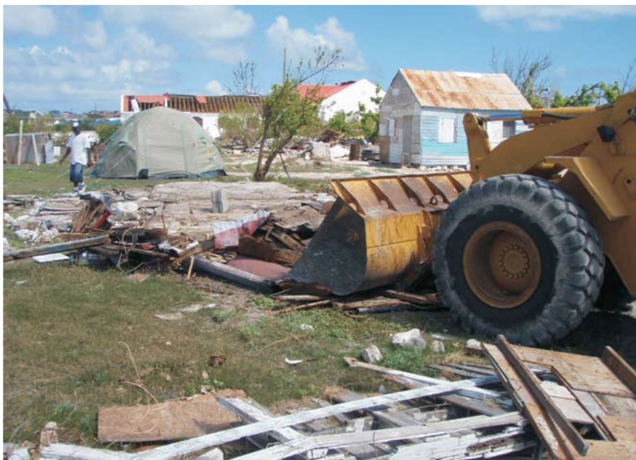
Clearing hurricane debris in post-hurricane Turks and Caicos Island 2008. Note the lack of appropriate equipment to segregate roofing and reusable boards.