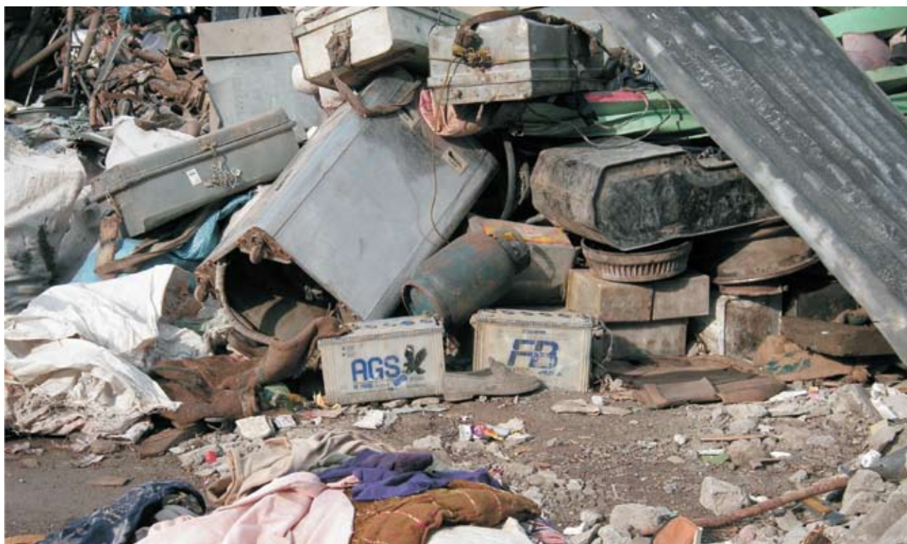
Hazardous waste (car batteries and LPG cylinder) mixed with debris, Balakot 2005.