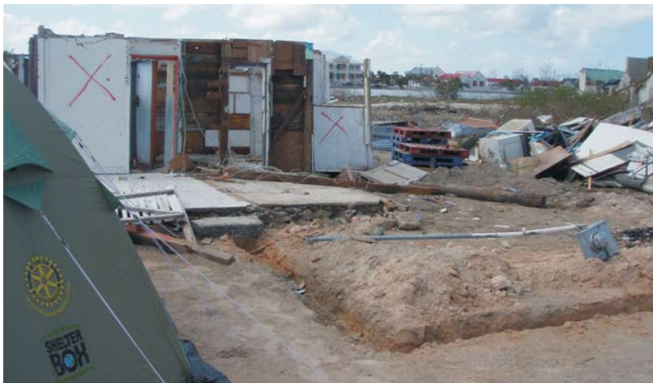
Typical hurricane debris where roof has been blown off and debris spread over area in post-hurricane Turks and Caicos Island 2008.

Unfortunately, current DW management practice often involves either no action , in which the waste is left to accumulate and decompose, or improper action , in which the waste is removed and dumped in an uncontrolled