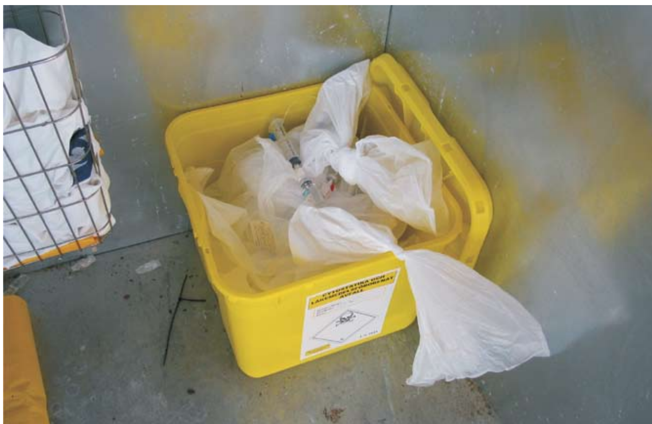
Healthcare waste is segregated and stored in clearly distinguished yellow container awaiting disposal.

Implementing agencies must coordinate and communicate to streamline waste assessment missions and