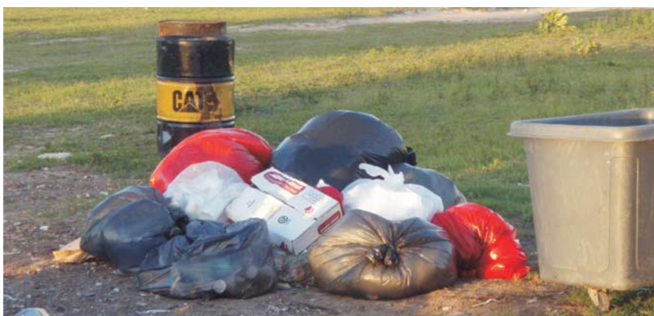
Mixed healthcare waste, including red bags indicating infectious waste, disposed of openly in post-hurricane Turks and Caicos Island 2008.