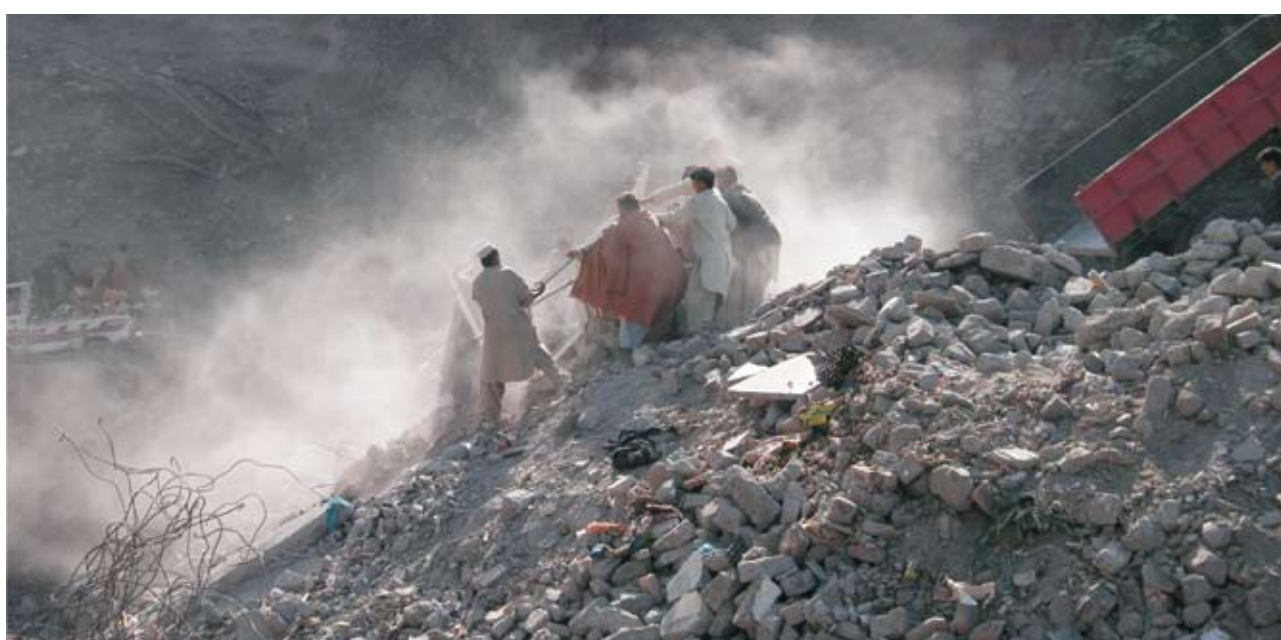
Salvaging scrap metal from post-earthquake debris, Muzaffarabad.