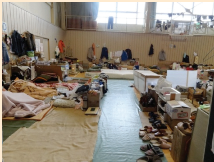
FIGURE 2: An evacuation center, one month after the earthquake

In May 2011, there were two reported cases of rape confirmed in the three affected prefectures after the disaster, compared to nine reported incidents at the same time in 2010. There were thirteen reported cases of forcible indecency compared to thirty-two cases in the previous year. The Minister of State said these incidents did not occur in the affected areas. It is difficult, however, to obtain verifiable numbers of sexual harassment incidents since they can take many forms—from sexual taunting to physical harassment—and often go unreported. At evacuation centers, personal alarms were distributed to protect women and children, and they were cautioned to avoid going to the outdoor toilets alone, especially at night.